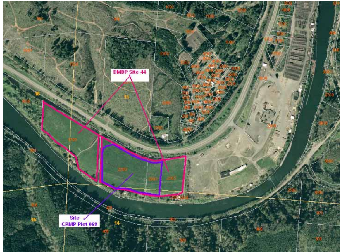
2004 aerial with site boundaries

“Large parcel on riverfront land, sloping from the river towards a drainage canal to the north. Part of old floodplain, with lower levels becoming seasonally wet.” (DMDP 1978).